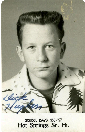
SCHOOL DAYS 1956-'57 Hot Springs Sr. Hi.