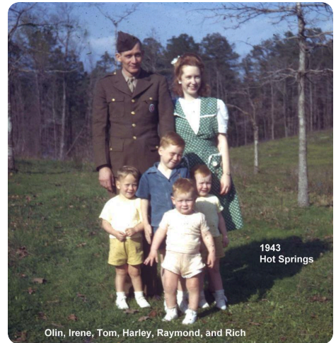
1943 Hot Springs