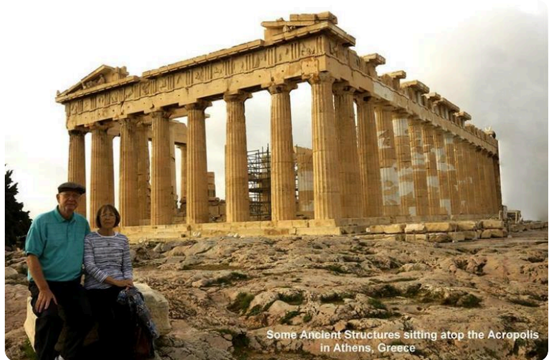
Some Ancient Structures sitting atop the Acropolis in Athens, Greece